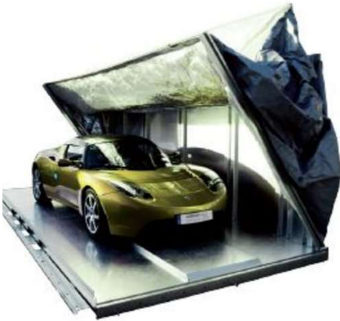
Figure: "fire tent" for electric cars [24]

Extinguishing blankets have the advantage of being very flexible and mobile. Additionally the low price compared to permanently installed extinguishing systems is very attractive for many users. So far, however, there have been only a few tests on the effectiveness of extinguishing blankets in fighting electric vehicle fires. Initial tests show that the fire appears to be well contained, but when the blanket is removed, re-ignition occurs immediately [22], [23]. Extinguishing blankets have the disadvantage that emergency personnel have to get relatively close to the damaged vehicle in order to cover it. There are therefore initial approaches to parking the car in a kind of "tent" from the outset and closing this tent in the event of an accident [24].