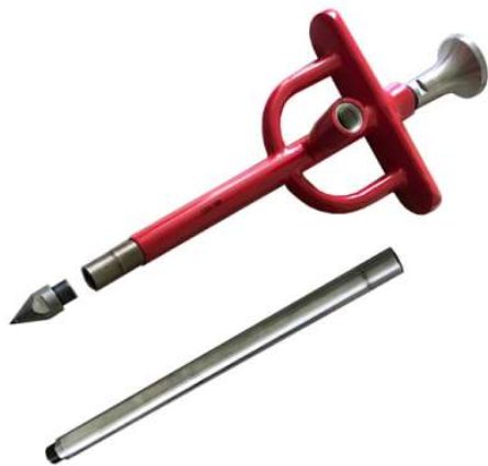
Figure: E-Extinguishing Lance

Vehicle batteries are made up of several modules, which in turn are integrated into a stable housing so that the battery cannot be damaged. Cooling or extinguishing agents cannot therefore attack the battery cells directly, which reduces the cooling or extinguishing effect. Scientific experiments have shown that water attack directly in the battery enclosure leads to significantly faster success [19]. Therefore, it is basically a good approach to use an extinguishing system to introduce the cooling water directly into the interior of a vehicle battery. Special extinguishing lances have been developed for this purpose [20]. The nozzle tip is to be hammered into the battery with the aid of an impact tool in order to introduce water directly there.