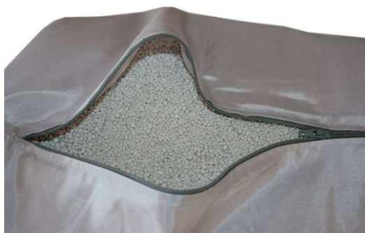
Figure: "lithium fire protection cushion" filled with expanded glass beads

Some manufacturers offer an extinguishing agent consisting of small glass foam pellets. They are sold, for example, under the name Pyrobubbles or Extover [8], [9]. The extinguishing effect is based on a separation effect that occurs when the glass beads hit the burning battery and then melt there, forming an insulating layer. The main disadvantage of this system is that it is difficult to use in an extinguishing system. To protect larger areas, a large quantity (volume, weight!) would have to be kept in stock accordingly. A further disadvantage is that a not inconsiderable part of the granulate simply rolls away when applied in unconfined areas and therefore cannot act at the source of the fire. An advantage is that hardly any damage is caused by the extinguishing agent. However, good results are achieved with these materials in structural fire protection - walls can be filled with this material straight away - and for transport systems of Li-Ion batteries. In the event of a fire of Li-Ion batteries, such packaging provides good protection against the spread of fire.