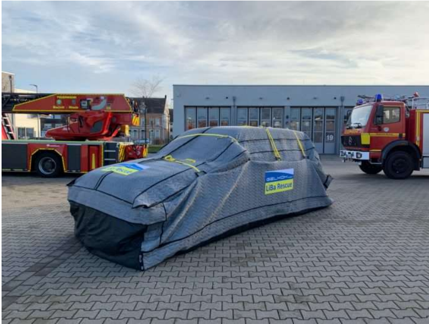
Figure: wrapping for damaged electric vehicles