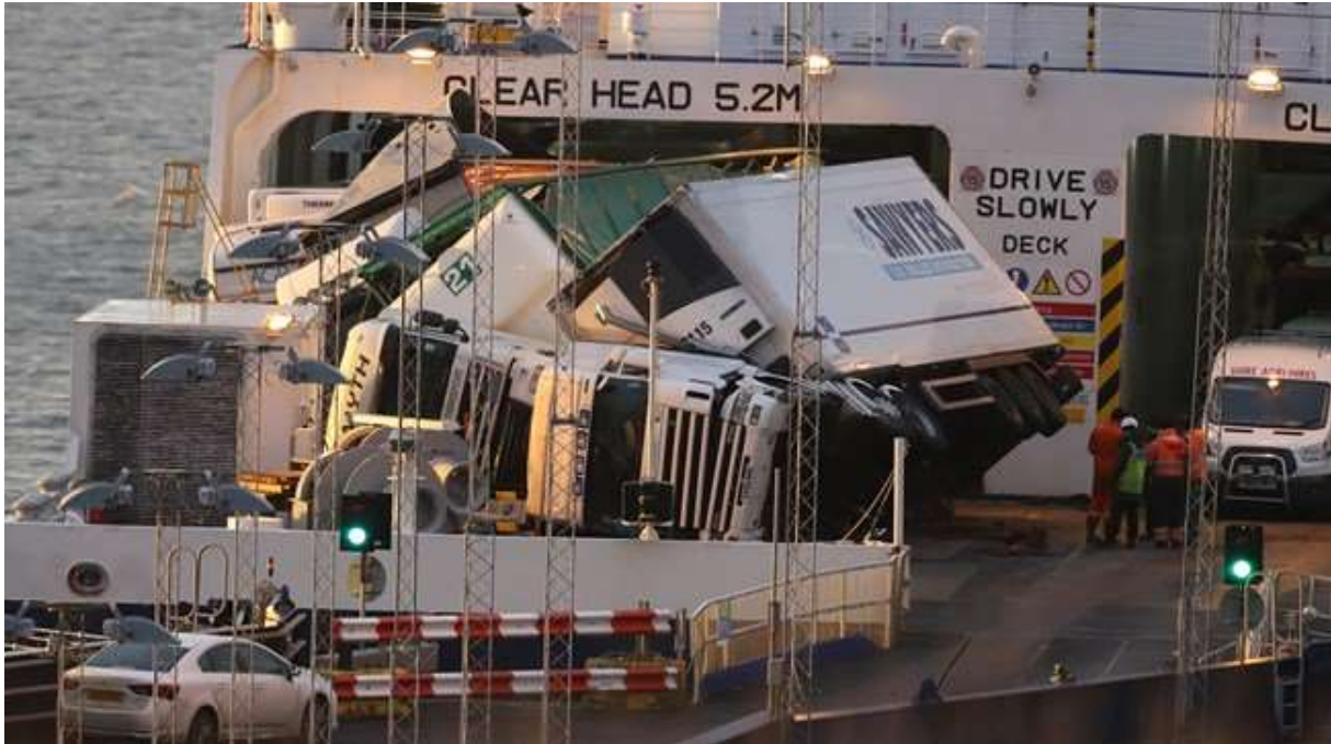
Figure 1: European Causeway damaged by severe weather (December 2018)

The following pictures show how badly vehicles can be damaged in accidents at sea: