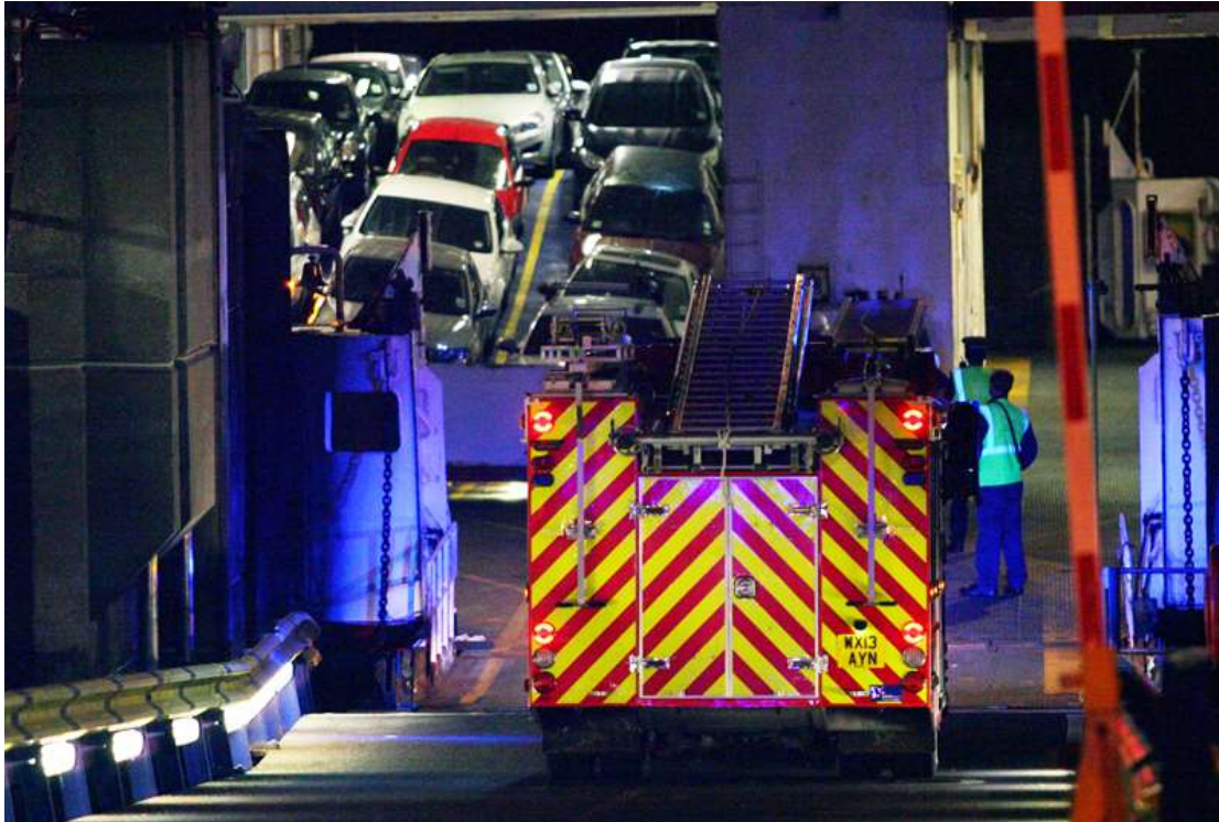
Figure 3: Accident of the "St. Helen" due to ramp breakage (February 2016)