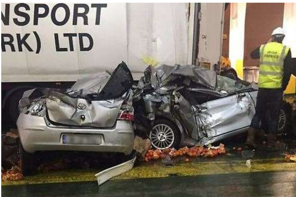
Figure 2: Accident of the "Epsilon" due to heavy weather (February 2016)